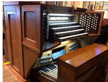
St. Cross Episcopal Church Hermosa Beach, CA New 4-Manual Draw-Knob Console

ROSALES ORGAN BUILDERS 3036 E. Olympic Blvd. Los Angeles, CA 90023 www.Rosales.com info@rosales.com 213-PIPE-ORG (213-747-3674)