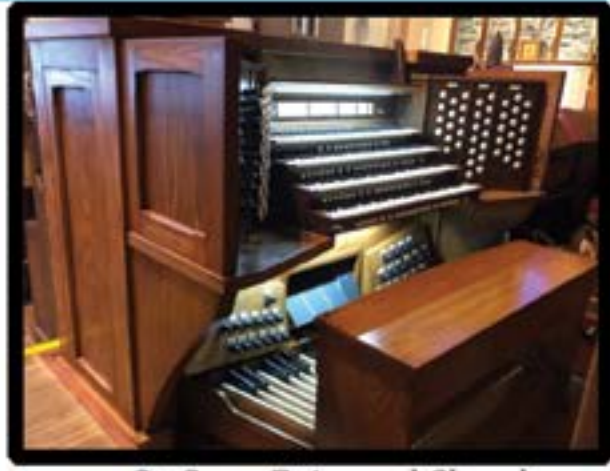
St. Cross Episcopal Church Hermosa Beach, CA New 4-Manual Draw-Knob Console